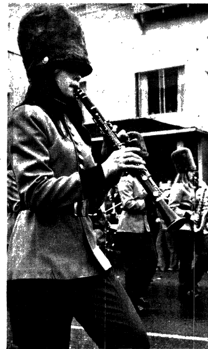
THE NEW LOOK--The Forks High School marching band was viewed by thousands as they displayed their new uniforms in the 4th of July parade.