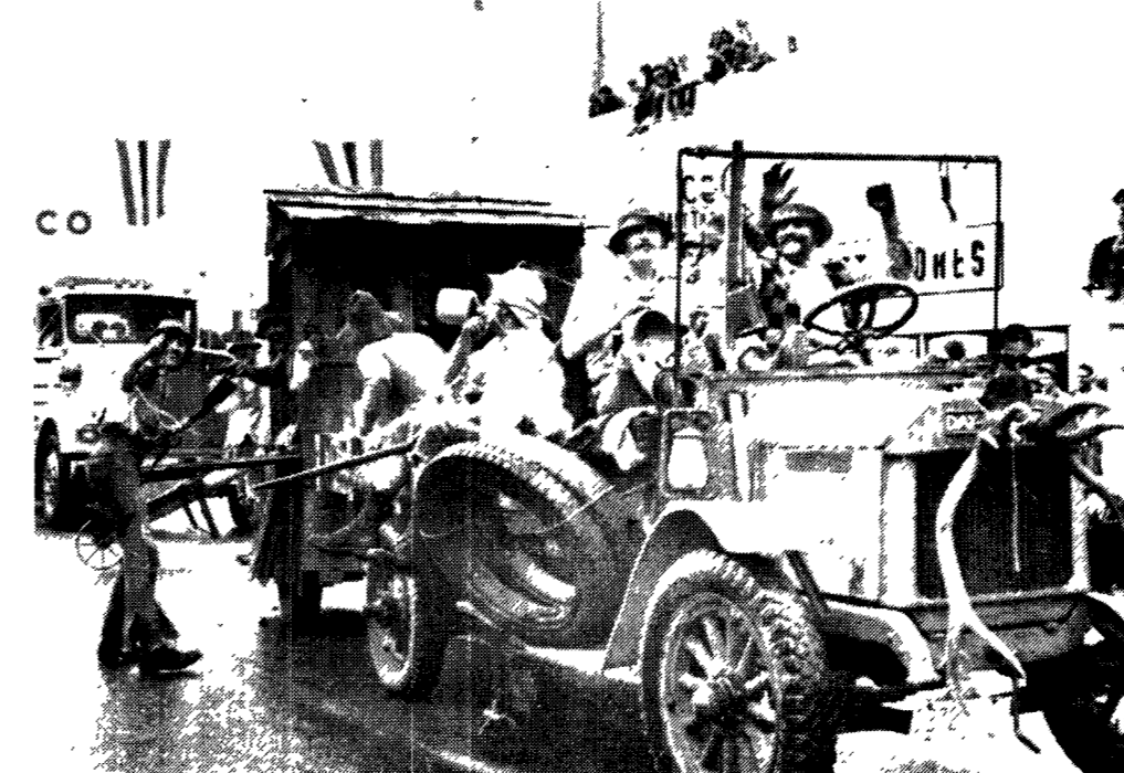
THE BEAVER HILLELIES-----outhouse, corn wildcye and all. By Lonnie Archibald